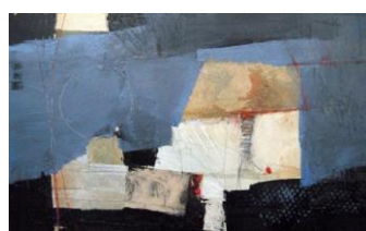
On the Wild Side