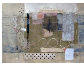
Rue de Blanc